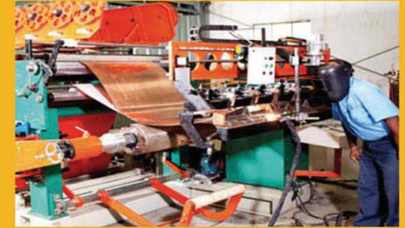
FOIL WINDING MACHINE