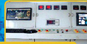
AUTOMATED TESTING FACILITY