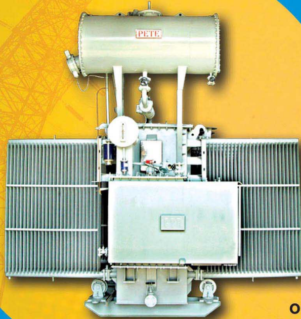
OIL COOLED TRANSFORMERS