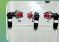
HV Bushing with inserts