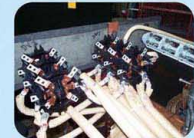
Load Break Switch