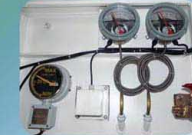
Liquid Level Gauge & Thermometer