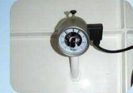
Pressure Vacuum Gauge